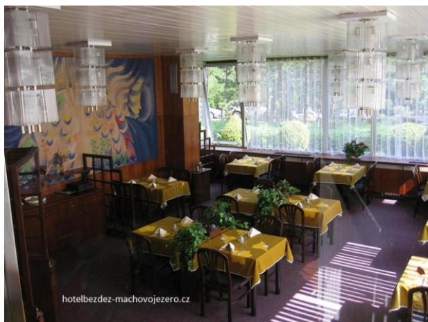
Dinning hall in the hotel