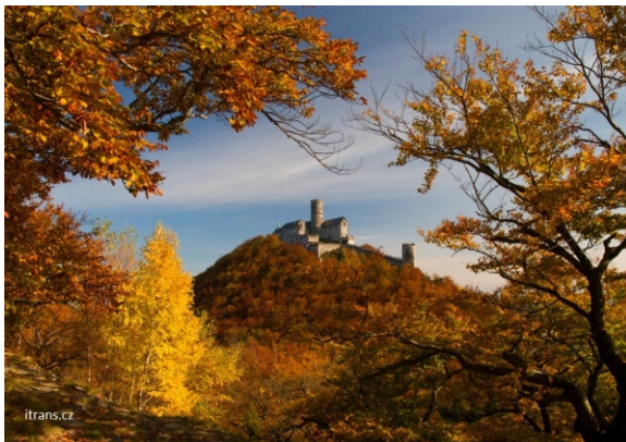
The Bezděz Castle

The dominant feature of the region is one of the most important early gothic castles in Bohemia – Bezděz . This royal castle was built on a hilltop (638 m a.s.l.) between 1260-1279 by a Czech king Přemysl Otakar II. The king Václav II. with his mother Kunhuta were held here as prisoners. During the 30years war (1618-1648) the castle was burned down by Swedish soldiers. Later it has been turned into a Benedictine monastery. After the Benedictines have left around the year 1785, the castle became deserted. It became a romantic ruin, which is described in many works by the most important Czech romantic poet – Karel Hynek Mácha.