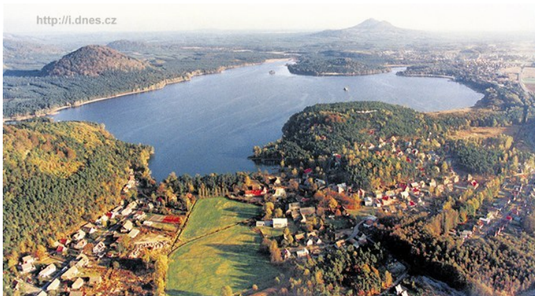
The Mácha's Lake