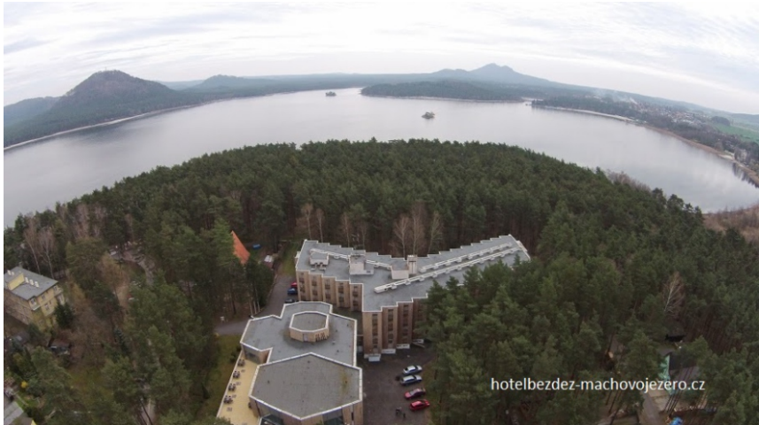
View of the Hotel Bezděz

The organizer will not assume any responsibility whatsoever for damage or injury to persons or property during the course. Participants are recommended to arrange for their personal travel and health insurance.