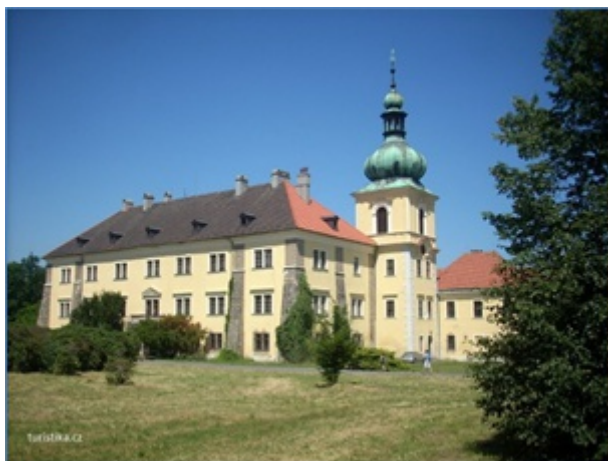
The Doksy Castle

The town of Stare Splavy, situated on the northern shore of the lake, became part of Doksy in 1850 and has ever since contribute to the development of tourism in the region.