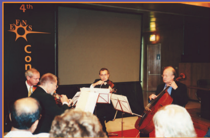
Neurological string quartet at the opening ceremony