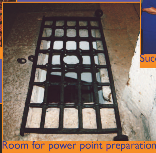
Room for power point preparation