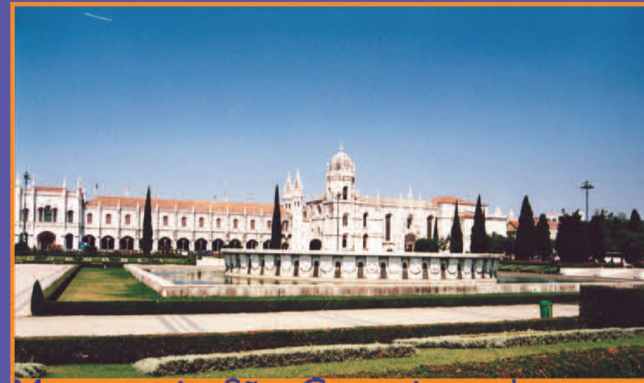
Monasterio São Geronimo, the conference center left from it