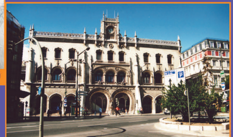
Castelo de São Jorge