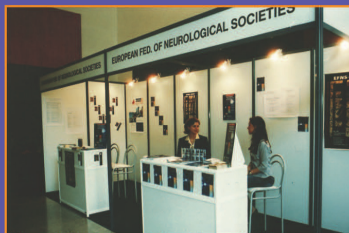
The EFNS booth in the exhibition hall