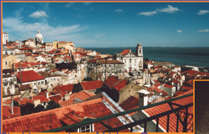
Final impression of Lisboa-Congress